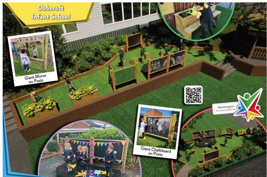
2 different potential plans