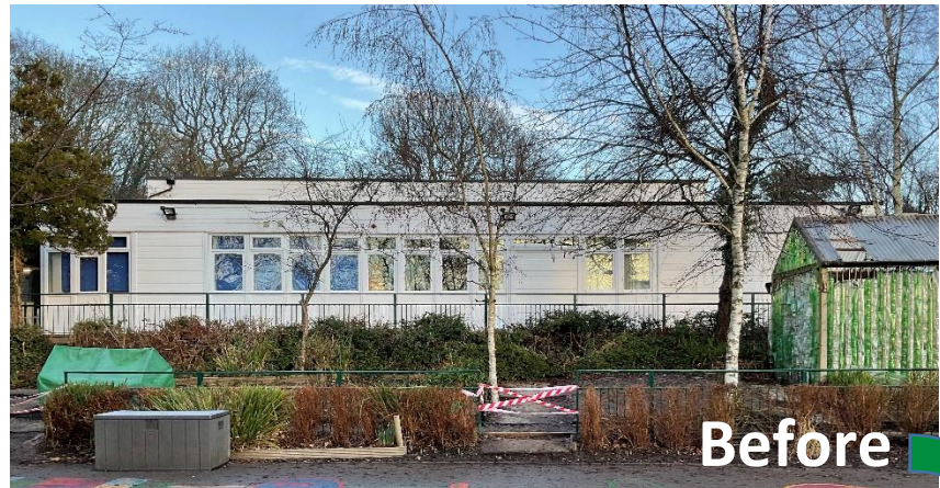
Existing zone in front of the school (left hand side)

We hope to dig down to make this area the same level as the playground. We are going to relocate the eco-greenhouse and create new raised beds in the Forest School area. Our Eco team will be helping us to do this on Sat 22 nd April, 10am-noon. Please come and join us!