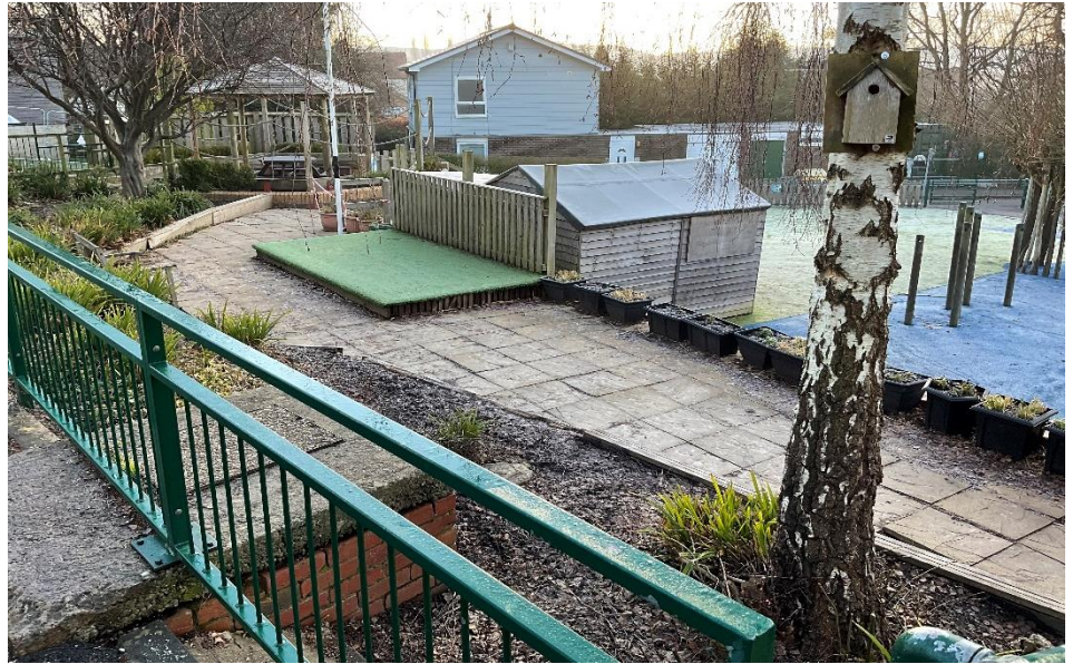
Existing zone in front of the school (right hand side)

We would like to improve the biodiversity by improving the range of planting to encourage more insects and birds to visit our school. The tree on the right hand side of the plot is a memorial tree that helps us to remember a child who is no longer with us, so we wanted to make this even more special by adding seating around it. We will keep the stage, as this is already a favourite part of the playground and we will add new flooring to make it an inviting space to spend time.