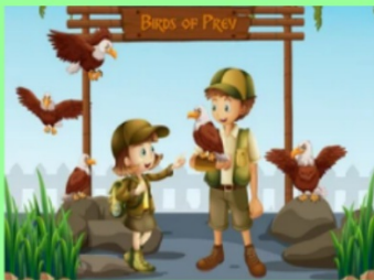
Talk to an expert