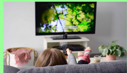
Watch a documentary